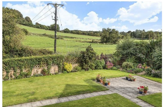
Lakeside Chase, Rawdon, Leeds, LS19